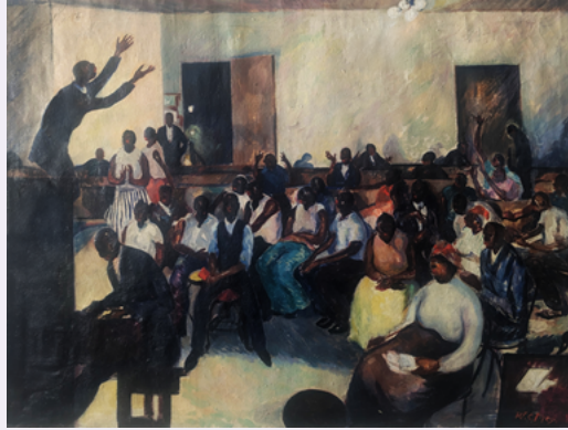
Meeting in Lombard Street by William C. Meyer

In recognition of Black History Month, the Everhart Museum presents a month-long exhibition combining paintings and poetry that celebrate voices that have not only become central to the black experience in America, but that are also staples of the American experiment. Through paintings culled from the Everhart collection and selected poetry, the exhibition highlights the shared desire to be heard.