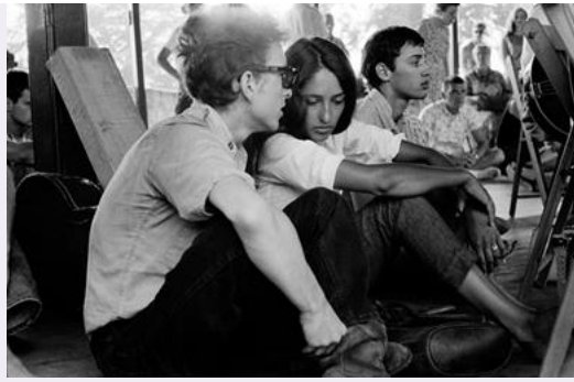
Bob Dylan and Joan Baez

Peace, Love, and Music looks at the art representing the musical voices and culture of the era through concert posters, ephemera, photography, and artifacts from the 1960s and beyond.