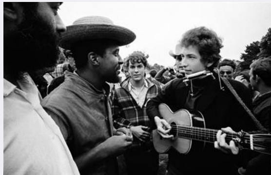
Bob Dylan and Len Chandler