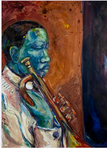
Trumpet Player by Verna Hart

In recognition of Black History Month, the Everhart Museum presents a month-long exhibition combining paintings and poetry that celebrate voices that have not only become central to the black experience in America, but that are also staples of the American experiment. Through paintings culled from the Everhart collection and selected poetry, the exhibition highlights the shared desire to be heard.