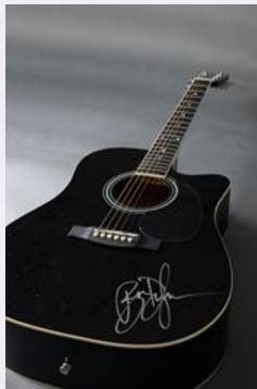
Guitar signed by singer-songwriter Bob Dylan

To coincide with the dates of the original Woodstock Music Festival in 1969, Peace, Love, and Music looks at the art representing the musical voices and culture of the era.