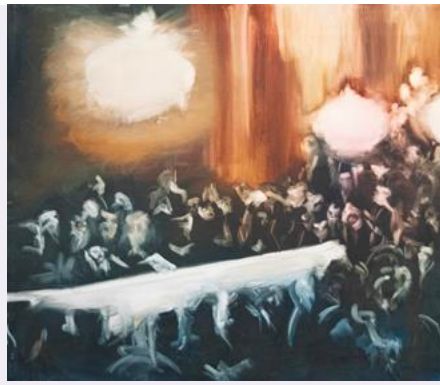
Farbringen in Brooklyn