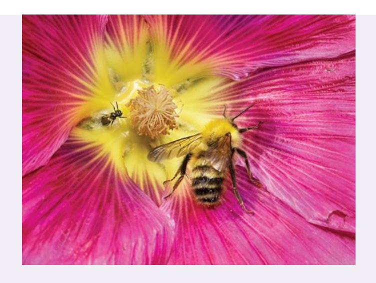
Bumblee by Paula Sharp

Now extended through October 29, Wild Bees: Photographs by Paula Sharp and Ross Eatman features colorful high resolution photographs of bees of many varieties in their natural habitats exhibiting their natural behaviors. Beekeeping tools and wares from the Everhart collection are also included.