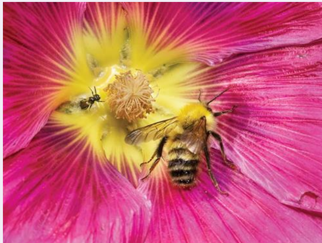
Bumblee by Paula Sharp

On view through October 1 , Wild Bees: Photographer Paula Sharp and Ross Eatman features colorful high resolution photographs of bees of many varieties in their natural habitats exhibiting their natural behaviors. Beekeeping tools and wares from the Everhart collection