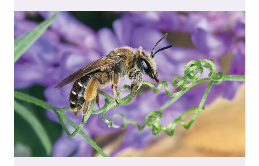
Wilkes Mining Bee by Paula Sharp

Opening Thursday, June 15 , Wild Bees , a traveling exhibition of work by photojournalist and writer Paula Sharp and photographer Ross Eatman, features colorful high resolution photographs of bees of many varieties in their natural habitats exhibiting their natural behaviors. Beekeeping tools and wares from the Everhart collection are also included.