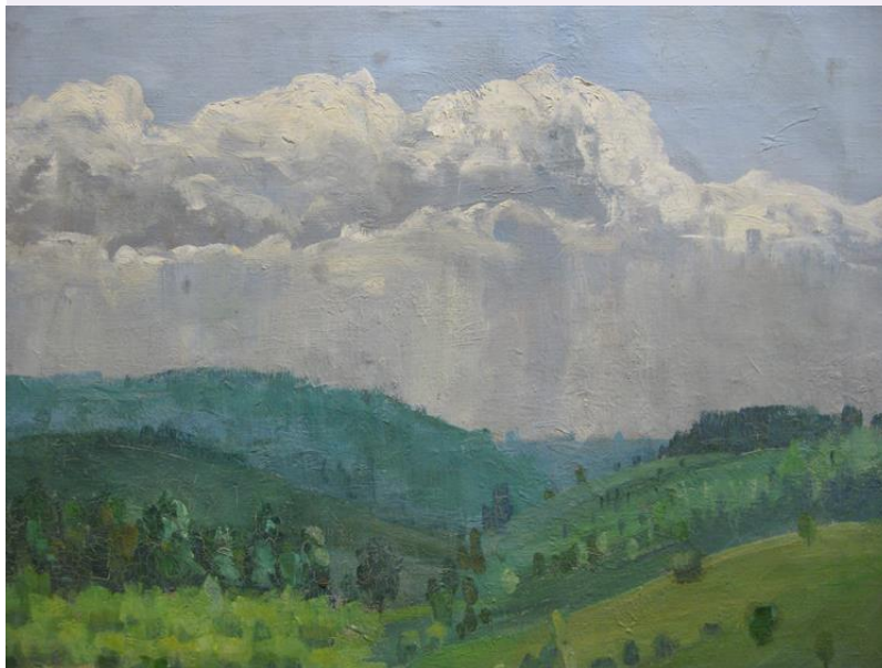
Thunder Clouds by Edith Reynolds

Opening March 2 to coincide with Women's History Month and on view through summer 2023 , Women in Art showcases the exceptional artistic legacy of female artists in Northeastern Pennsylvania and beyond, as well as exemplary works depicting women. Bringing together a diverse group of artists, each with their unique style, voice, and vision, the exhibition is a testament to the power of women in art, both as creators and as subjects.