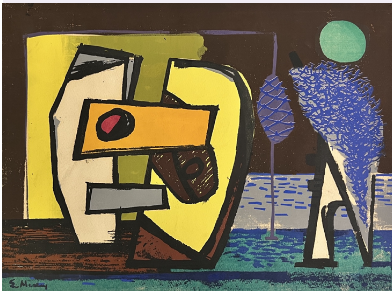
Untitled, Eugene Morley (1909–1953), screenprint, 1937, gift of Anton Refregier, 67.43

Opening February 2 and on view longterm, Works on Paper highlights selections from the rich collection of ink sketches, charcoal drawings, engravings, etches,