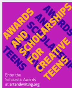
Scholastic Art Gold Key Exhibition February 2–26

Opening on February 2 to coincide with the Museum's reopening and on view through February 26 , Scholastic Art Gold Key Exhibition showcases the work of Gold Key Award recipients for the Northeastern PA Region of the Scholastic Art Awards. The Awards are an annual juried multimedia contest for students Grades 7–12.