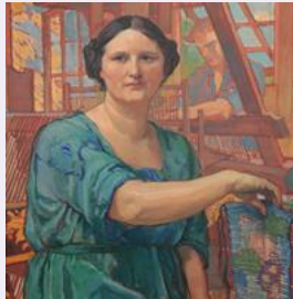
Women in Art March 2–Summer 2023

The Everhart celebrates Women's History Month in March with the opening of Women in Art on March 2 , which highlights the work depicting and by women from the Everhart's collections and is on view through summer 2023