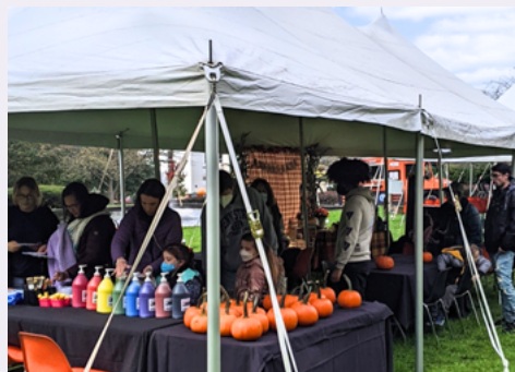
Rakin' in the Fun: Community Day, October 8