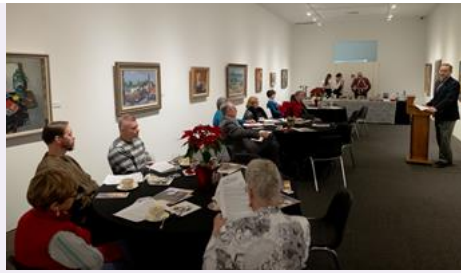
Planned Giving Tea, December 11

The Museum's Rakin' in the Fun and Snow Much Fun fall and winter community days, made possible by the Overlook Estate Foundation, brought in hundreds of members of our community for free admission, activities, and entertainment in the fall and winter, as did In Full Bloom: Free Admission Day in August .