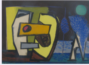
Works on Paper February 2–Ongoing

Opening February 2 is Works on Paper , a semi-permanent regularly-changing gallery of ink sketches, charcoal drawings, engravings, etches, photographs, and more in the Everhart's holdings.