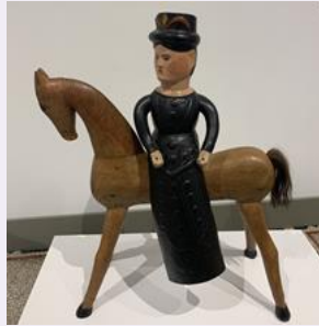
Folk Art Gallery September 28–Ongoing

Opening September 28 through the generosity of the Oppenheim Family Foundation, the new semi-permanent Folk Art Gallery highlights selections from the Museum's expansive and diverse collection of American folk art, including paintings, etchings, calligraphy, sculptures, store signs, dolls, toys, and more.