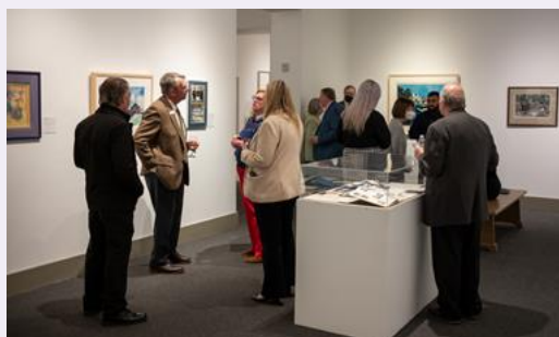
Changing Frequencies reception, December 1