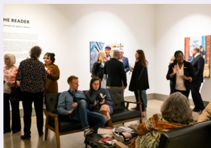
The Reader exhibition opening, September 30

The Museum also reopened its ever-popular Rocks and Minerals Gallery , thanks to funding from the Robert Y Moffat Family Charitable Trust.