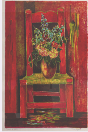
Chaise Rouge by Tony Agostini

In Full Bloom: Flowers of the Everhart showcases the essence of flowers as captured through painting, drawing, 3D art, and photography. The exhibition draws from the Museum's rich and extensive collections to celebrate flowers' ephemeral beauty and the efforts to preserve it through diverse artistic methods and styles across cultures and time. Artists featured in this exhibition include Jon Carsman, Evelyn Metzger, Margaret Oettinger, and more.